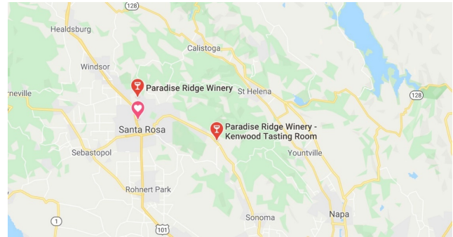
Exhibit 3: Paradise Ridge's Tasting Room Locations