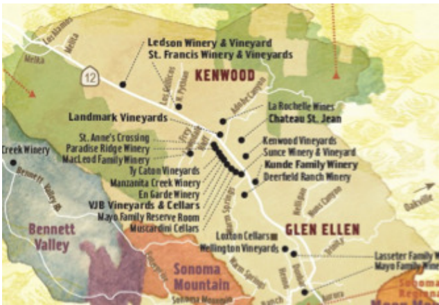
Exhibit 4: Highway 12 Tasting Rooms